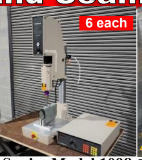
Bench Press, With Power Supply.