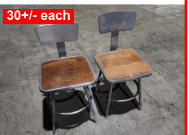
Metal Chairs with Wooden Seats $8.00 each Buy All $200.00