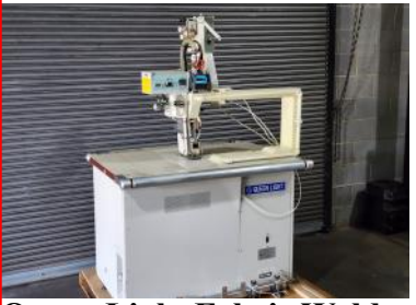
Queen Light Fabric Welder Fabric Welding Machine Set up with a 45MM Wheel Width