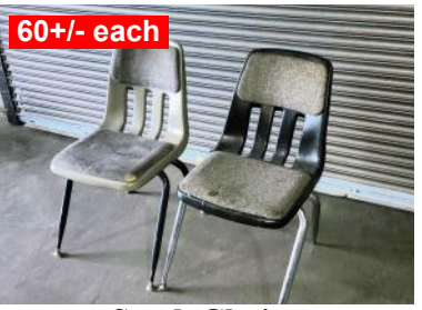
Stack Chairs $5.00 each Buy All $225.00