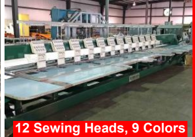
Embroidery Machine China Model GG766-912 Set up w/ USB Drive Feed