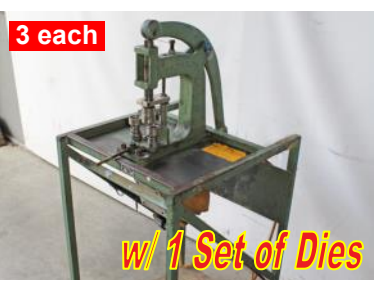
Handy Button Press Manual Button Cover Press $750.00 each