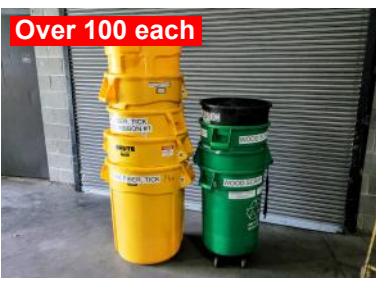
Trash Cans 20 Gallon - 55 Gallon Round and Square