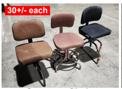
Operator Chairs Most Without Wheels $25.00 each