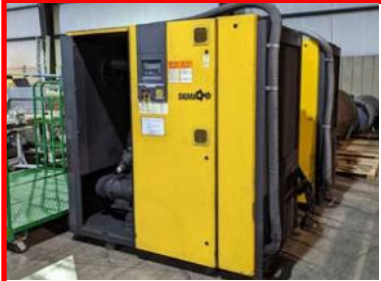
Kaeser Model CSD-100 100 HP Screw Air Compressor 2007 model year, 460v, 3 phase