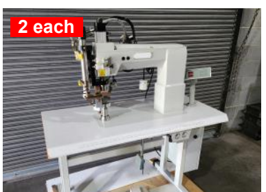
Fabric Welding Machine Set up with a 25MM Wheel Width Reduced $1.495.00 each