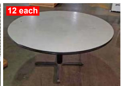
Canteen Tables 54" Round $49.00 each Buy All $550.00 Buy All Chairs & Tables $700.00