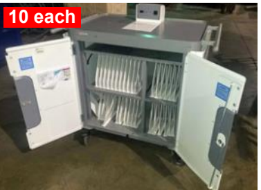
Bretford Charging Carts Portable carts w/ built in batteries to charge electronic devices

$15.00 - $35.00 each Reduced $150.00 each Buy All $1,150.00