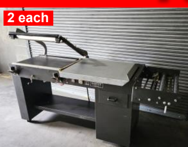
Eastey L-Sealer Model EM28T 28" x 20" Sealing Area