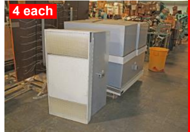
Honeywell Air Cleaners, Series 11001 Reduced $250.00 each Buv All $975.00

$15.00 - $35.00 each Reduced $150.00 each Buy All $1,150.00