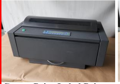
CompuPrint Label Printer Model 4247-Z03