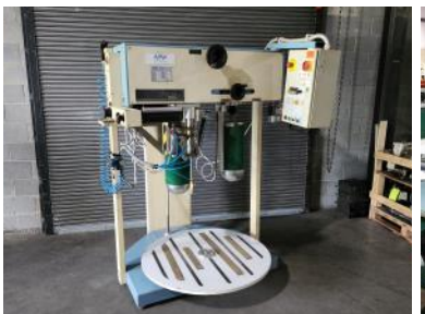
AMP Pisani Bias Unit Model TPM/1000 Automatic Collarette Cutter