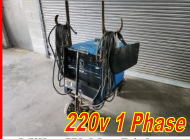
Miller Welder Dialarc 250 AC/DC Stick Welding and Air Carbon Arc Cutting