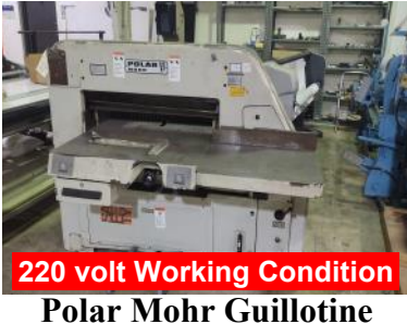
Paper Cutter Model 82ST, 32" blade width