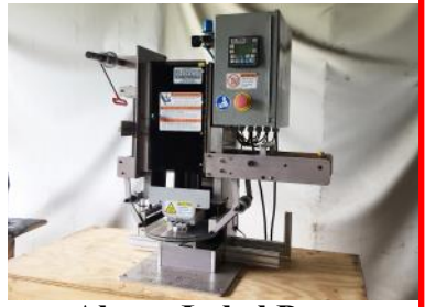
Altena Label Press Label Application Roll to Roll Reduced $1,995.00