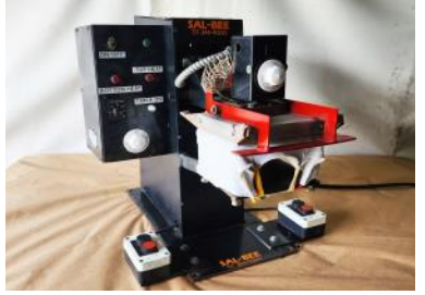
Sal-Bee Model PK67TB Heat Seal Machine 6" x 7" Seal Area