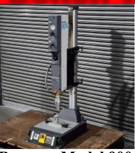
Components in photo only. No Power Supply