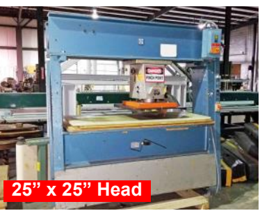
USM Hydraulic Press Traveling Head, 25 Ton 64" x 25" Work Space

Additional fee will apply to orders of less than 10 sections.