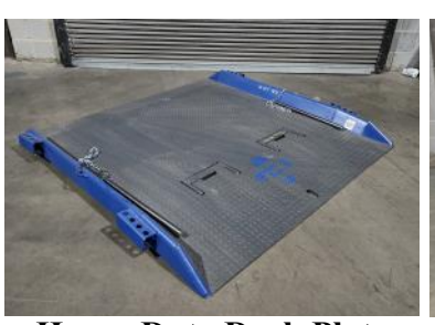
Heavy Duty Dock Plate 72" Long x 72" Wide 15,000 lbs. capacity