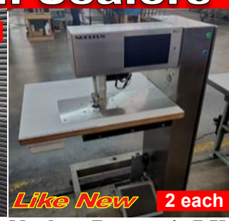
Sonics Model 1098 Nucleus Rotosonic DX1 TC12 Flatbed, Continuous Seam Sealer. Year: 2020