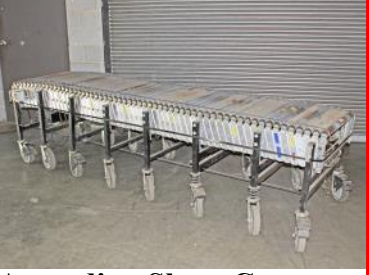
Accordion Skate Conveyor 25' Extended, 24" Wide Rollers