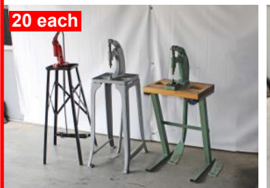
Manual Kick Presses Buy 2 or more $195.00 each