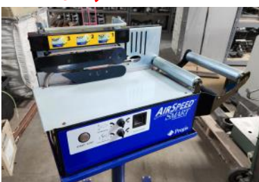
Pregis AirSpeed Smart Inflatable Packaging Machine