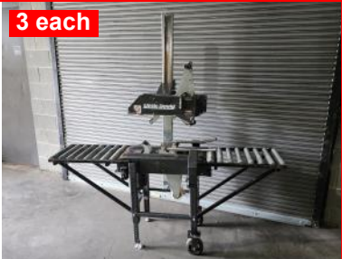
Plastic Strapping Machine 28" Tall x 24" Wide Little David Tape Machine 80" Overall Length, 15" Rollers 80" Overall Length, 15" Rollers Buy All 3