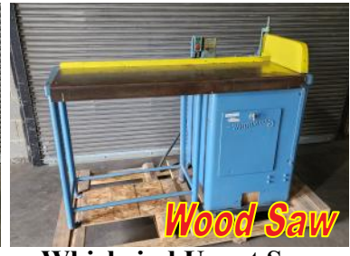
Whirlwind Upcut Saw 55" x 15" Work Area 4" Chop Height, 220 volt