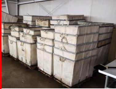
Dandux Hampers - Canvas & Vinyl 6, 16, 20, and 24 Bushel Sizes Available 100's in stock. Good condition and poor condition. Price is determined by the condition. Call for details now.