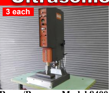
3 Total Available. "Selling As Is" $800.00 each...OR Buy All...$2,000.00