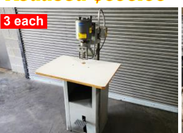
Paper Drills Several to Choose From