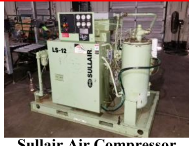
Sullair Air Compressor Model LS12 50 HP Screw Compressor