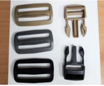
Plastic Slides and Buckles

Tan, Grey, and Black Slides Over 26,000 total Tan and Black Buckles Over 1.500 Total