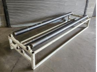
Fabric Cradle 96" Wide Fabric Capacity Non-Motorized