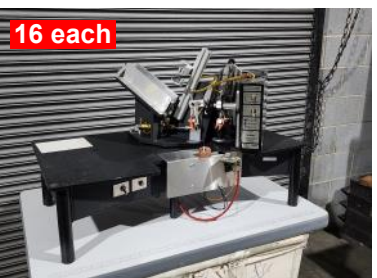
Brother Model F500B Automatic Swift Tack Staplers Single and Dual Heads $250 to $450