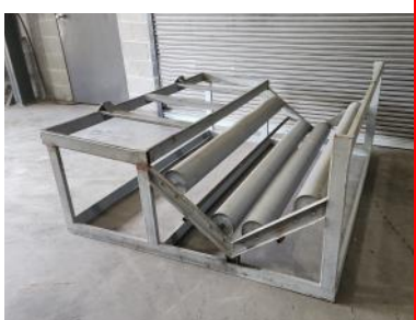
Heavy Duty Fabric Cradle 72" Wide Fabric Capacity Non-Motorized